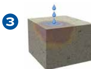
3 The crystalline technology is activated in the presence of moisture.