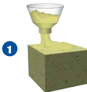
1 PENETRON ADMIX is added to the concrete at the time of batching.