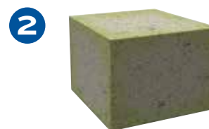
2 The concrete sets and has integrated PENETRON protection.