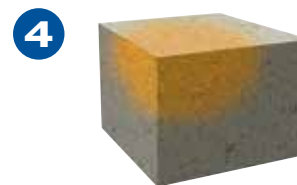
4 The concrete structure is protected against moisture penetration.