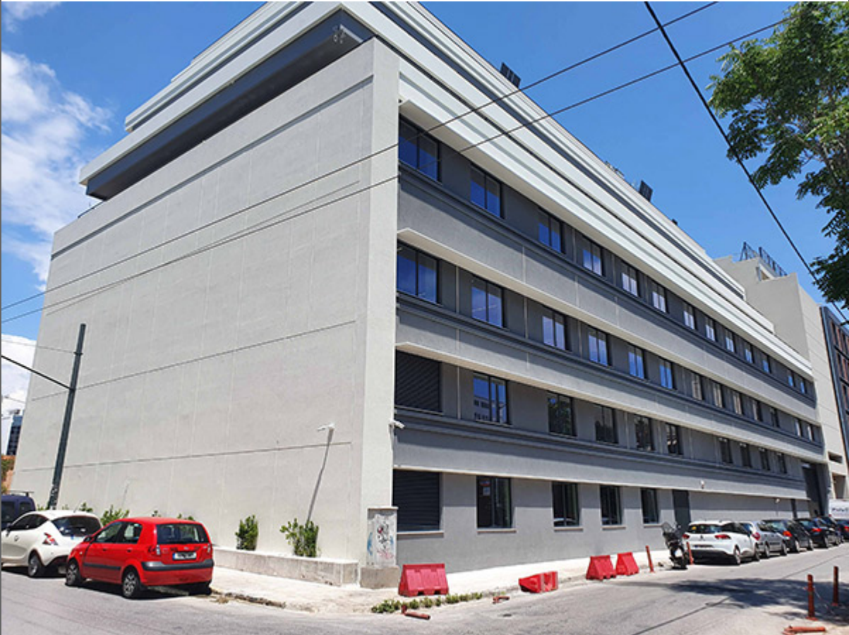
One & Only Aethesis, Glyfada, Greece

With three below-ground levels next to the Piraeus Port, PENETRON ADMIX was the obvious choice for a concrete waterproofing solution. Supporting the LEED Gold certification of Piraeus Port, Penetron products were chosen due to their sustainability certifications, including EPD and GREENGUARD Gold. Specifying PENETRON ADMIX enabled the designers to forego unsustainable (and more costly) waterproofing membranes to extend the life of the concrete structure and thereby reduce the carbon footprint of this project.