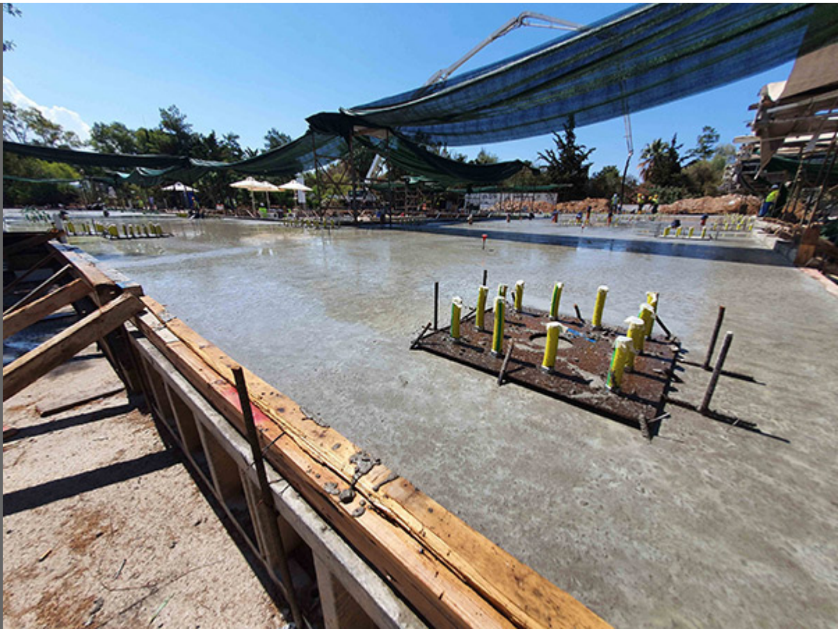
BS Design Corporate Towers, Fortaleza, Brazil