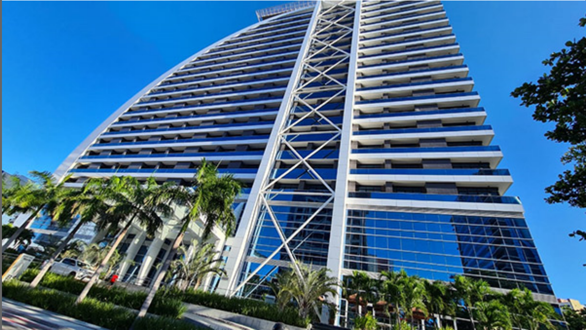
Forluz Company Headquarters, Belo Horizonte, Brazil

To ensure the durability, as well as support the sustainability requirements of the project, PENETRON ADMIX-treated concrete was used for the entire foundation of this landmark building.